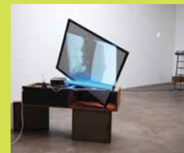
Haroon Mirza 'Birds of Pray' 2010 (detail)