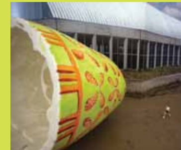
Lubaina Himid 'Jelly Mould Pavilions' 2009-10, Acrylic on ceramic, Dimensions variable