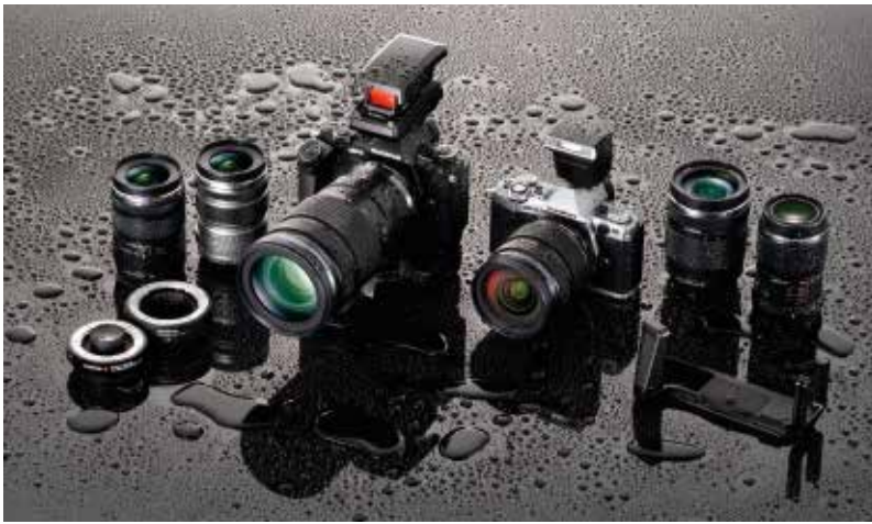
Olympus makes a range of weatherproofed lenses and accessories for the E-M5 Mark II