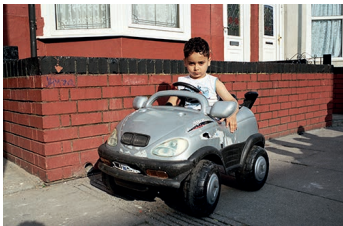
Boy with BMW toy car, 2009