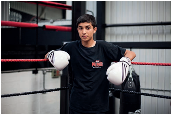
Young boy, white boxing gloves, 2010