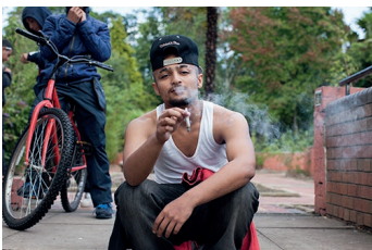
Eyebrow tracks, white vest and baseball cap, 2012