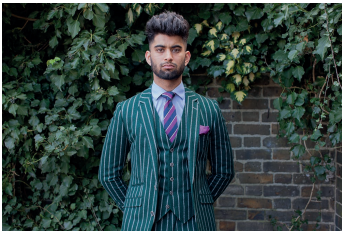
Green chalk striped suit, 2017