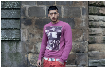
See No Evil, 2012