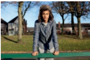
Denim shirt, trapper hat, hair design