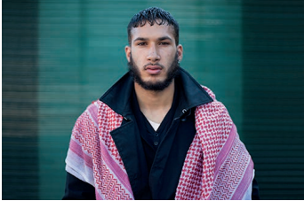
Shemagh, beard and bling, 2010