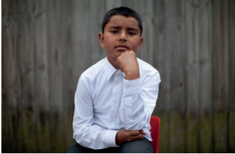
Young boy in white shirt, 2012