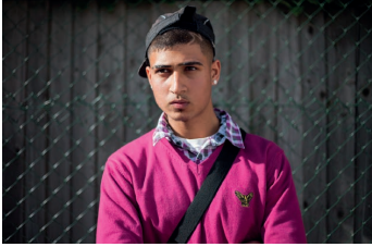
Pink jumper, hair design, bling, 2010