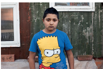
Young boy with Bart Simpson t-shirt, 2012