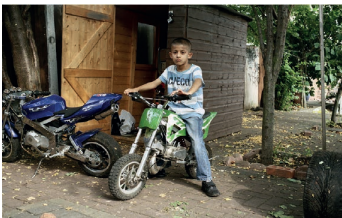
Boy with scrambler, 2009