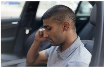
Grey polo, hair design, car, 2012