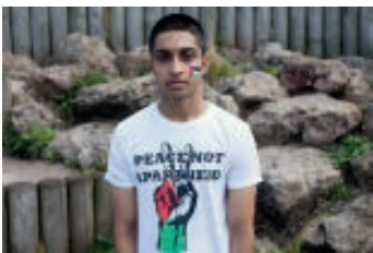
Young man with Palestinian flag, 2014