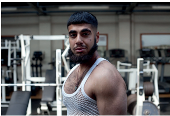
String vest, two tears, 2012