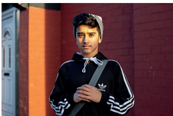
Young boy in pink and grey beanie, 2014