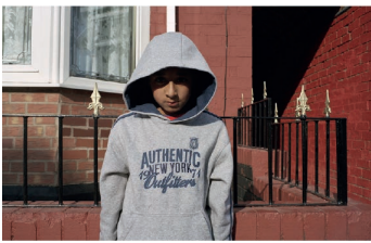
Boy in grey hoodie, 2012