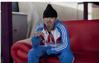
Black hat, black glove, and bling, 2012