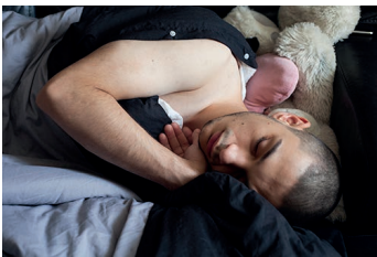
Young man asleep, 2010