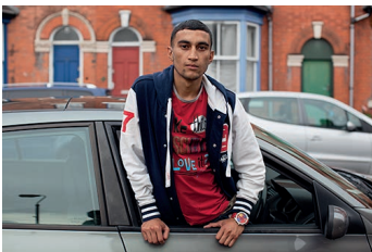
Red t-shirt, baseball jacket, car, 2012