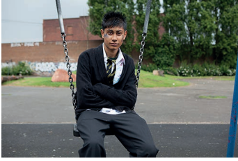
Teenager, swing and last day at school, 2010