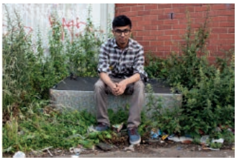
Young man, checked shirt on bed base, 2012