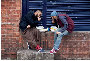
Friends, curry, sauce 'n' chips, 2012