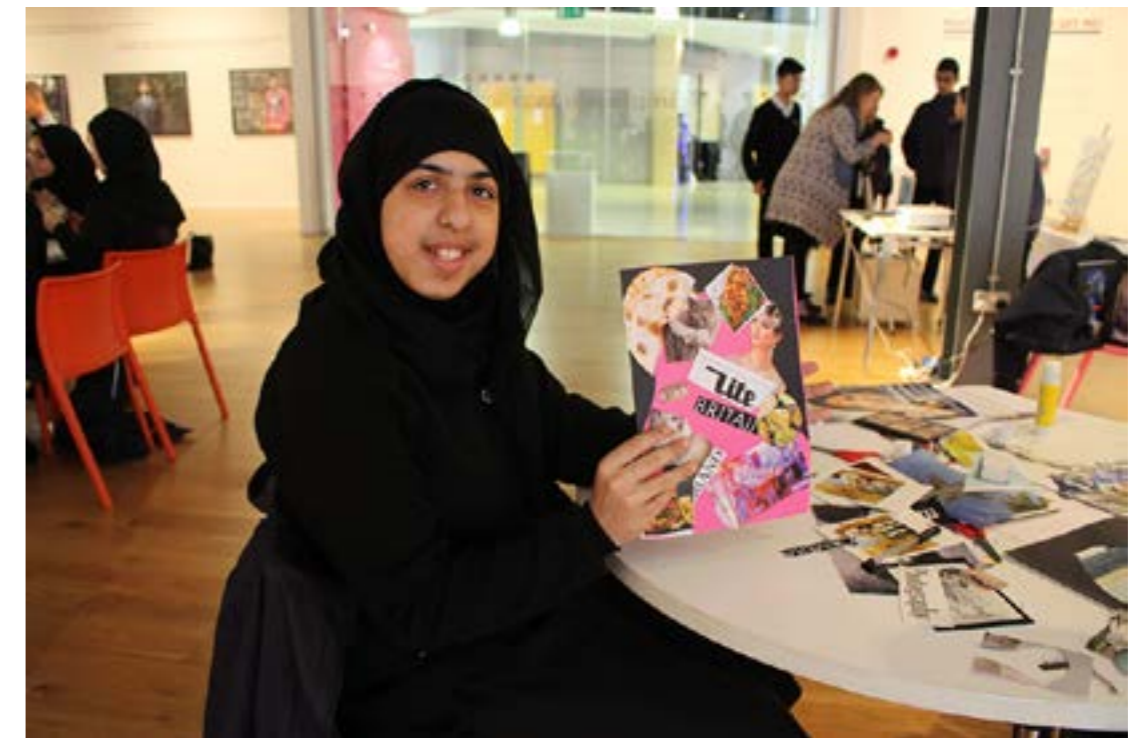
Collage workshop with Dixons McMillan Academy, Bradford