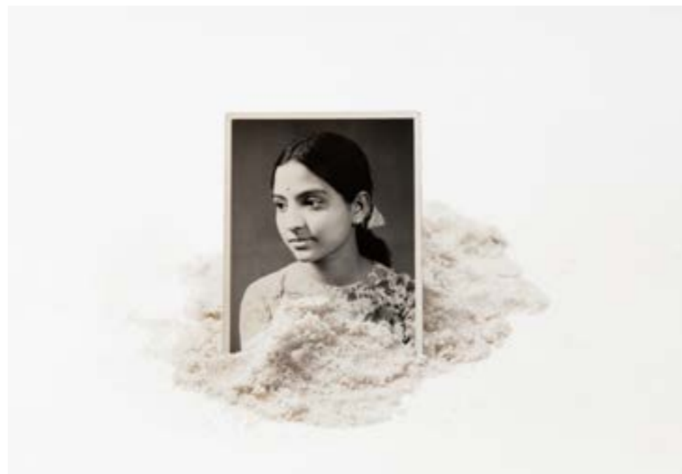
Untitled © Arpita Shah