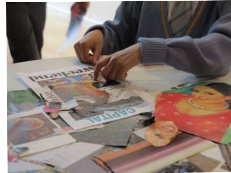
Collage workshop with Dixons McMillan Academy, Bradford