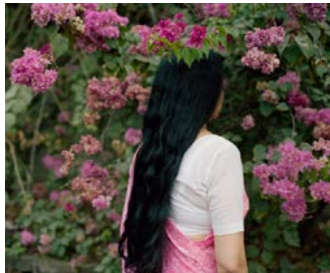
Bougainvillea Maharas © Arpita Shah