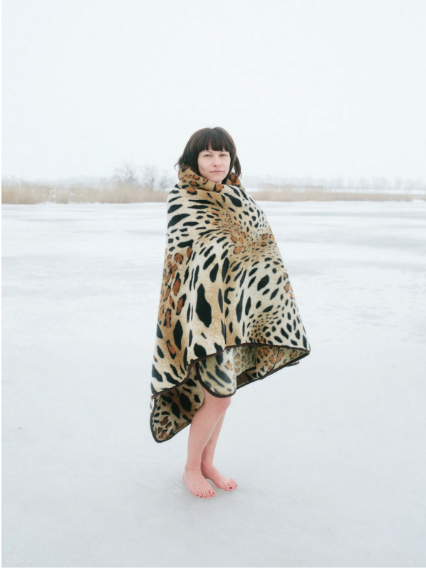
Near Bilyts'ke, Donetsk region, January 2015

Participants in Epiphany rituals submerge themselves three times in the freezing water to honour the Holy Trinity, symbolically washing away their sins from the past year, and to experience a sense of spiritual rebirth.