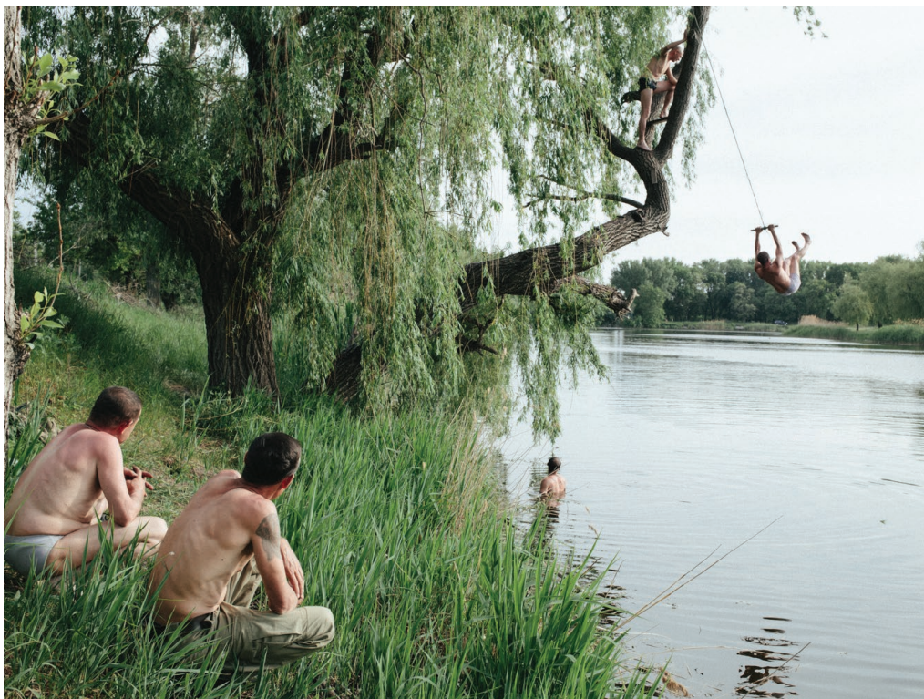
Druzhkivka, May 2015

Ukrainian soldiers from the 81st Airmobile Brigade relax by the Kazennyi Torets River. The brigade fought in the Battle of Donetsk Airport and was stationed in a former children's summer camp in Druzhkivka.