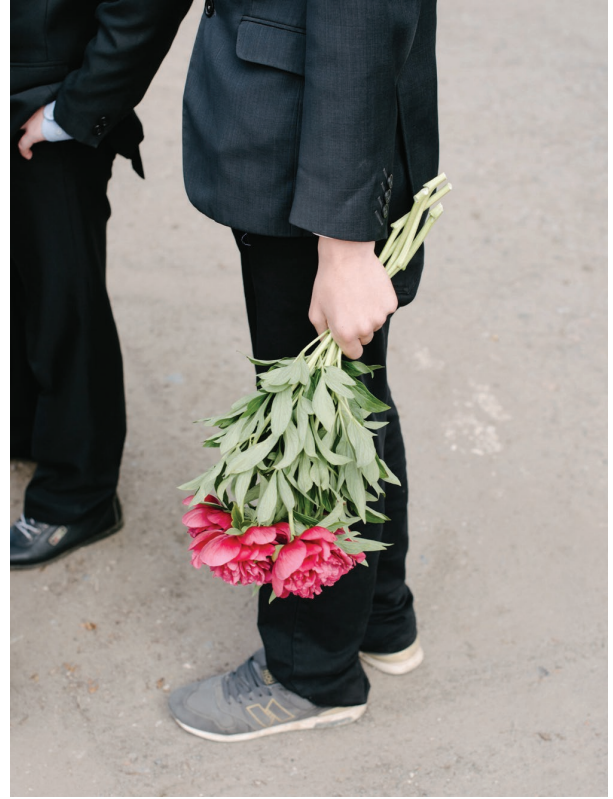
Last day of School, Druzhkivka May 2017

Participants in Epiphany rituals submerge themselves three times in the freezing water to honour the Holy Trinity, symbolically washing away their sins from the past year, and to experience a sense of spiritual rebirth.