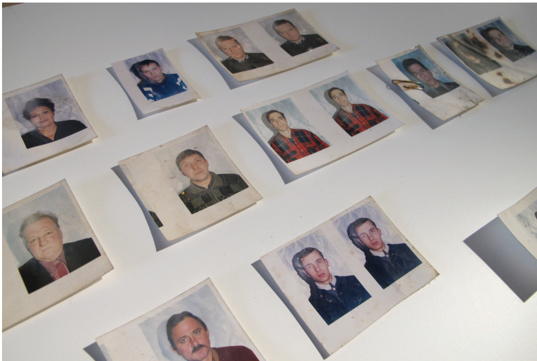
Vitrine display Found identity photographs, Toretsk

"When soldiers first came here from different parts of Ukraine they thought we were all wearing makeup. They had never met miners before, they didn't understand that we work hundreds of kilometres underground digging coal."