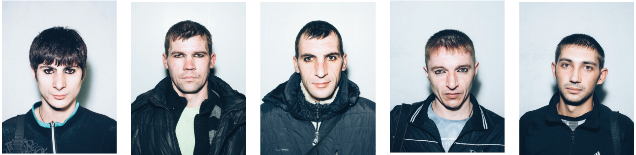
Miners, Toretsk, 2016-2017

"When soldiers first came here from different parts of Ukraine they thought we were all wearing makeup. They had never met miners before, they didn't understand that we work hundreds of kilometres underground digging coal."