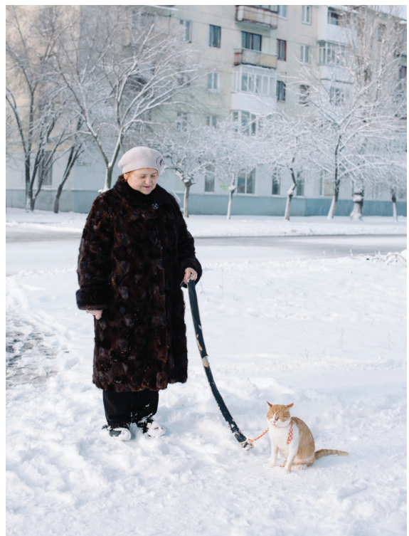
Sieverodonetsk, Luhansk Region January 2017

Svitlodars'k is near the frontline and its population has shrunk to just a few thousand.