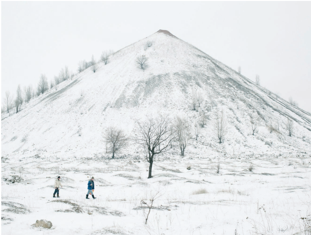
Slag heap on the fringes of Toretsk January 2016